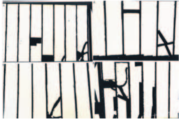
SKYLIGHT 5 (extract): A piano concerto! Upper register instruments play horizontal information above the mid-line, lower register instruments play horizontal information below it. Percussion plays vertical information. Piano plays everything else. Black = sound, white = no sound.

If you want to know the greatest problem with teaching improvisation, maybe you should start right there: who's defining the rules? Should there be any? And what happens if you break them? Are there «good» and «bad» in a universally accepted sense? How do you teach something that, at least nominally, has no accepted norms? I believe that all effective teaching is the act of facilitating the process of people teaching themselves. Improvisation is about you, naked, in the moment. Any training should recognize and accept who you are, so that you don't feel that you have to be someone else. And what works for one player might not work for another. Some like to be told that «this is 'good' and this is 'bad' and you should do as I tell you». It's the old-fashioned way to learn, to sit at the feet of an elder and absorb everything they can give you unconditionally. And when you're ready, you move on and establish your own place. For some people maybe it's easier to work things out collectively with others, trying things out, learning to recognize and deploy the elements that feel like strengths and to avoid or eliminate what feel like weaknesses. Find a common language, music as an ongoing conversation. And as with any conversation it may not always be witty and scintillating, it may even be pretty banal, but the