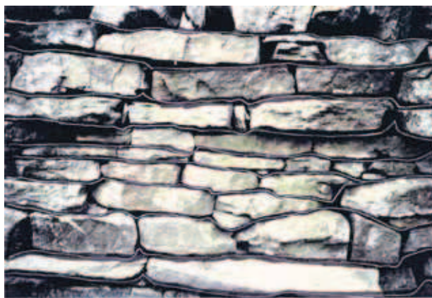
DRY STONE II: «Wal» is constructed from bottom up. Each stone represents a solo. Conductor indicates each soloist, and then brings her in. When the next soloist enters, the previous soloist must freeze the last fraction of whatever she is playing and loop it, continuing the loop throughout the first three «lines» of stones while making a slow decrescendo. This process occurs three times, with the conductor indicating each time the process starts again.

about trying to do the right thing at the right time. At this point I might also introduce some of my graphic scores (which are partly reproduced in this article), particularly the ones that deal with memory and repetition like Screen and Dry Stone .