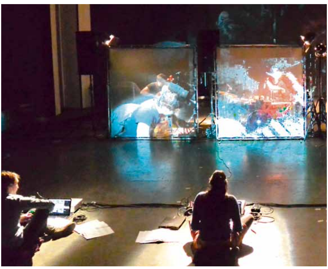
Nadar Ensemble performing "Generation Kill" at Platform Moskou 2013: 4 performers with gamecontroller, 4 musicians behind

At the same time digital capabilities allow for solutions that are much more radical than what was available only a few decades ago to other "gestural deconstructors" like Ferneyhough or Lachenmann.