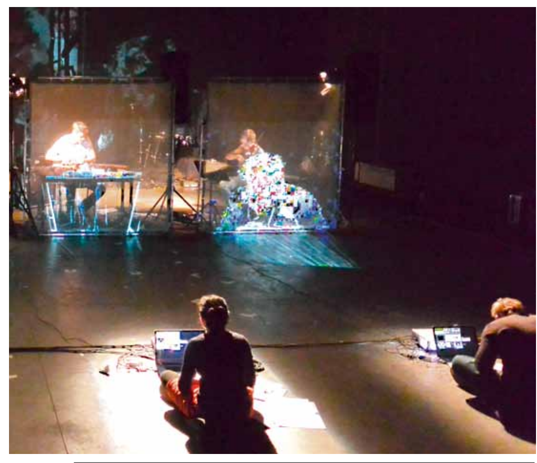
the screens, 4 video-projections.